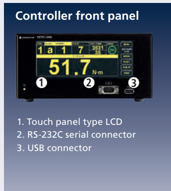
Controller front panel