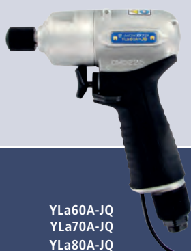
YLa60A-JQ YLa70A-JQ YLa80A-JQ