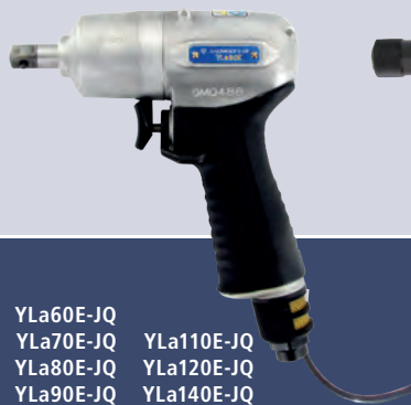
YLa60E-JQ YLa70E-JQ YLa80E-JQ YLa90E-JQ YLa110E-JQ YLa120E-JQ YLa140E-JQ