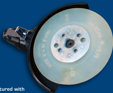
Rubber pad pictured with TAG series grinder