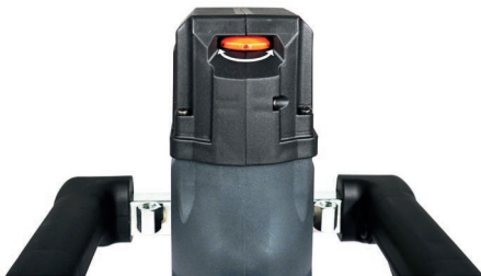
Variable Speed Adjustment