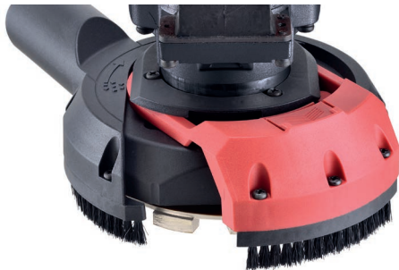
Sliding Cover For Edge Grinding - Tool Free