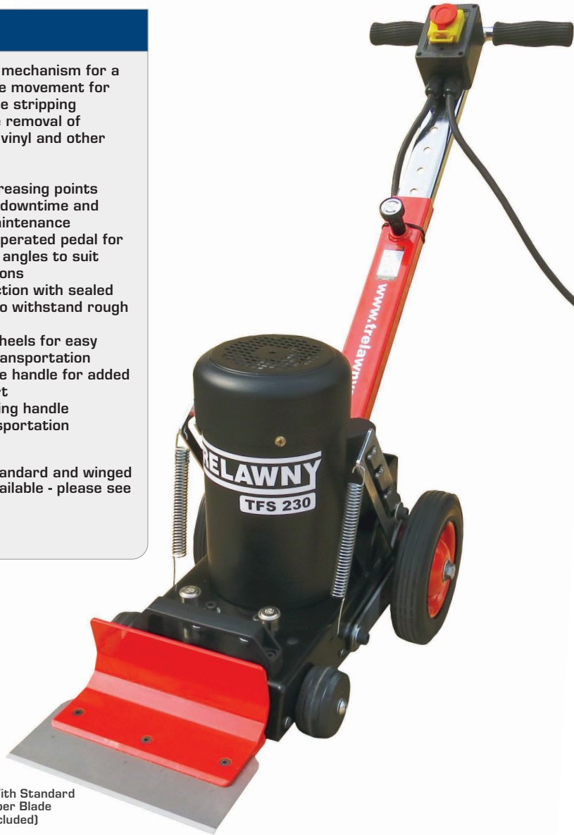
Shown With Standard Scraper Blade (Included)

Replacement standard and winged U Blades are available - please see page 202