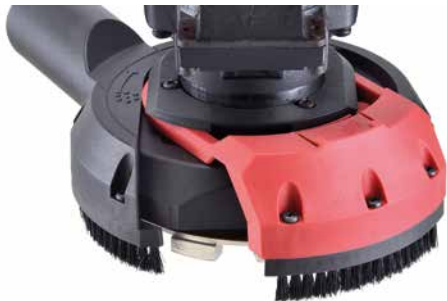
Sliding Cover For Edge Grinding - Tool Free