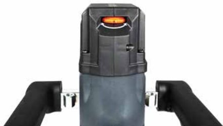
Variable Speed Adjustment