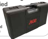
Supplied With Hard Plastic Carry Case