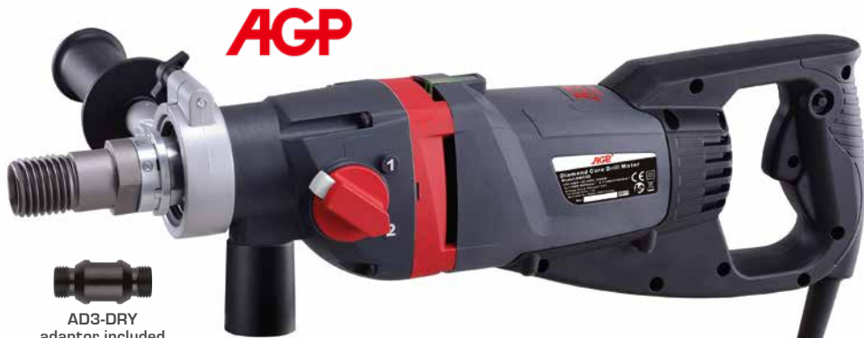
AD3-DRY adaptor included

IDEAL FOR USE AS PART OF THE BORO YOKOTA DUST FREE CORE DRILLING SYSTEM